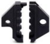
Spare die for CRIMPFOX-TC 4

Replacement die - CRIMPFOX-TC 4/DIE - 1212295